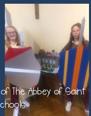
Our fifth and sixth classes took part in a fantastic celebration of The Abbey of Saint Thomas the Martyr along with a number of local schools.