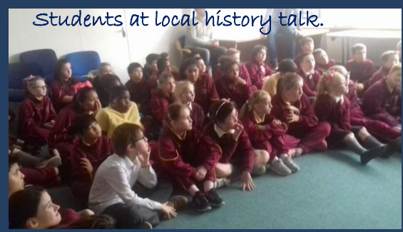
Students at local history talk.